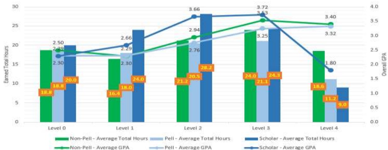
Figure 1: Earned Hours and GPA by Level

Figure 1 shows the average earned hours and yearly GPA during the 2018-19 and 2019-20 academic years by level in these three different groups. Hours in major courses and required math courses are considered to be earned if grades are C or above, while hours in other courses are earned if grades are D or above. Non-Pell eligible students tend to have better GPA across all levels than the Pell eligible group. They also tend to earn more credit hours in all levels with the exception of level 1. The largest gap is at level 4: students in the non-Pell eligible group earned about 7 more credit hours on average than in the Pell eligible group. From level 0 through level 3, Scholars earned more hours with better or similar GPAs compared to the other two groups. The gap of earned credit hours in level 1 and 2 is very impressive: in average, Scholars earned about 7 more credit hours than the other two groups. Such gap at level 3 is trivial because almost all scholars starting at level 3 in fall tend to graduate in the following spring. They have taken all the courses they need for graduation. There was only one scholar at level 4 who started in fall and took 3 computer science courses to graduate on December of the same year. Therefore, data about the single scholar at level 4 is not statistically meaningful.